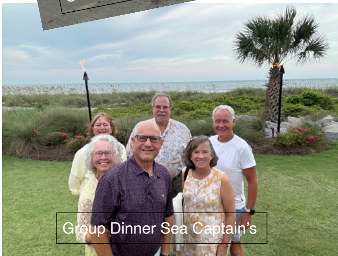
Group Dinner Sea Captain's