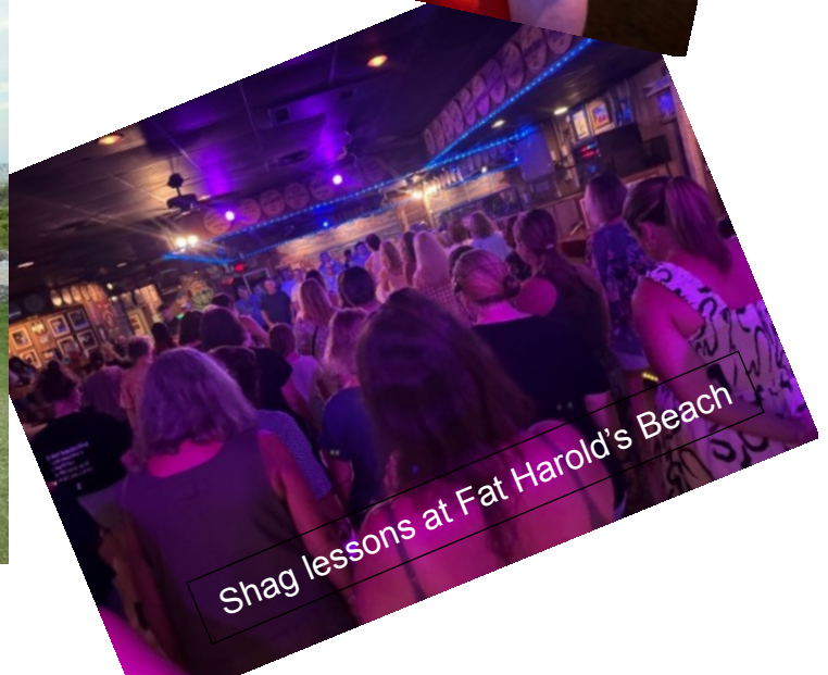
Shag lessons at Fat Harold's Beach