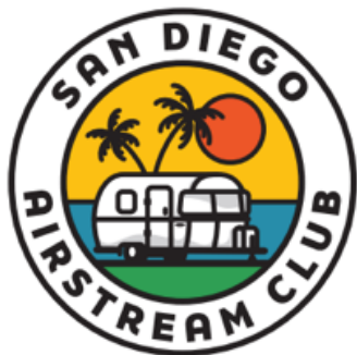
SDAC Approved Logo