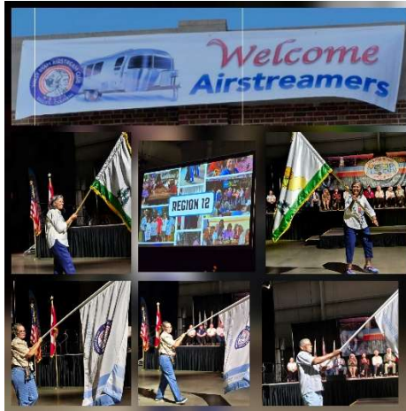
Welcome & Opening Ceremony