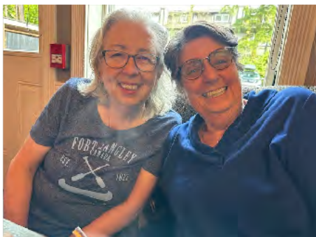
Tuesday Breakfast Antics