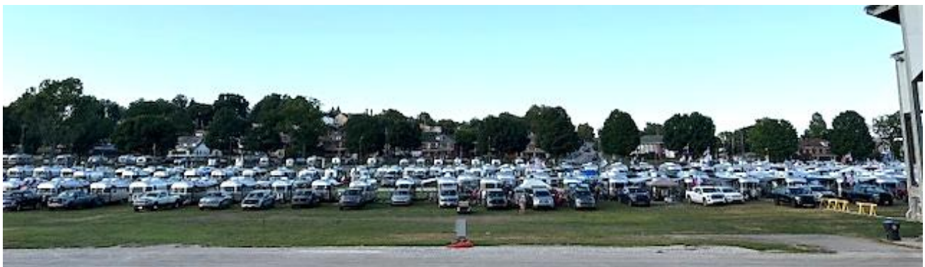
Trailers parked on the infield of the York State Fairgrounds racetrack at this year's international rally.

Complete post-rally report forms that the treasurer will send to you and return to the treasurer.