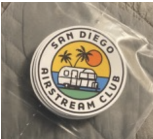
New SDAC Logo Sticker