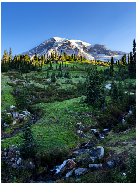
Mt. Rainier National Park