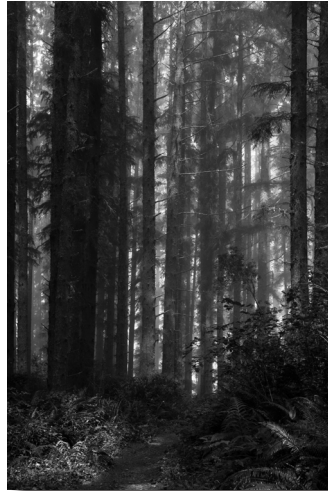
Redwood National and State Park