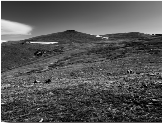
Tundra - Rocky Mountain National Park