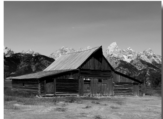
T. A. Moulton Barn Grand Teton National Park