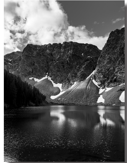
Blue Lake - North Cascades National Park