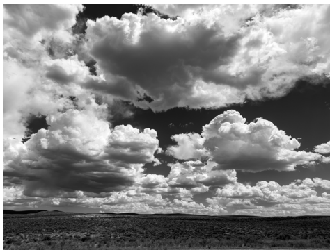
Rt 189 in Wyoming