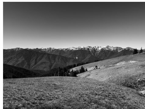
Hurricane Ridge - Olympic National Park