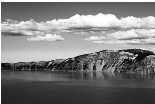
Crater Lake National Park