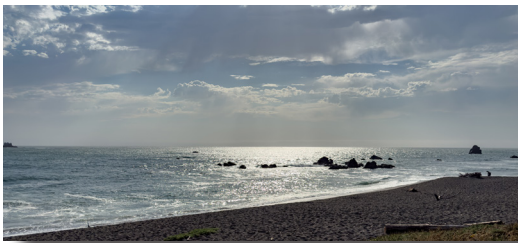
Northern CA Coastline

Photography is a means for us to capture these special places and moments. Our photography leans into minimalism and simplicity creating a peaceful calm mood. One of our goals for the work is for viewers to find it relaxing, engaging and thought provoking. Upon returning to the noise and chaos the memories tend to fade. Revisiting the photographs takes us back to re-live the memories and feelings affording us another escape from the noise and chaos.