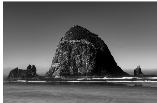
Haystack Rock - Cannon Beach, OR