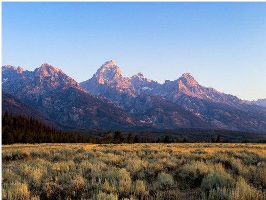
Early Morning - Grand Teton National Park