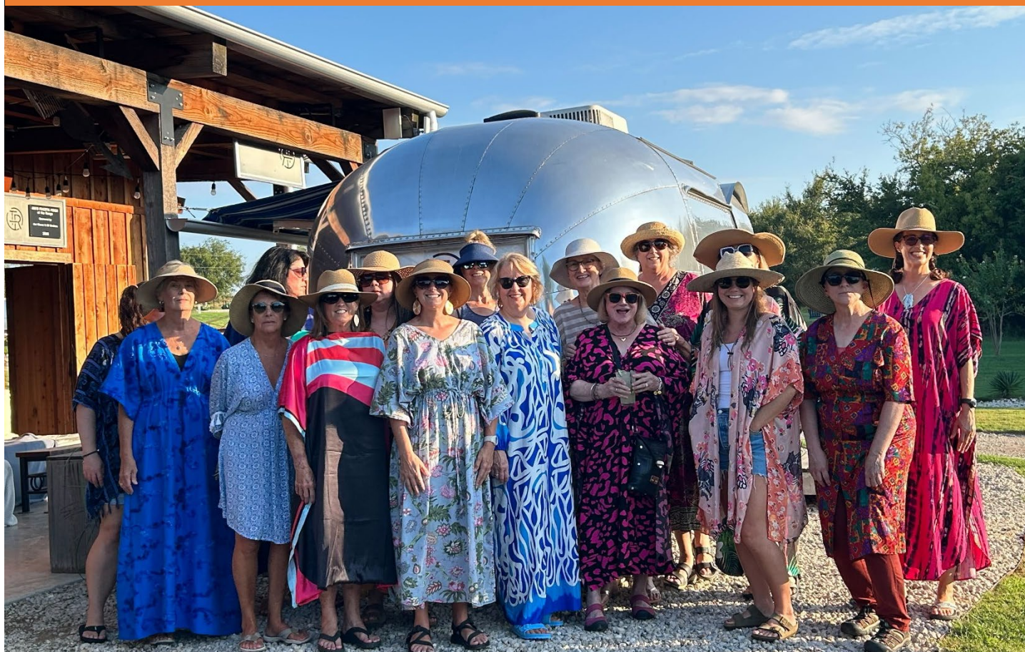
The Range Vintage • Trailer Resort Ennis, Texas • September 4-7, 2025