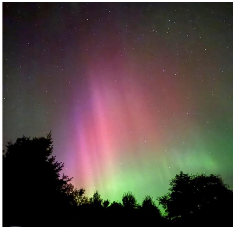
The Northern Lights as seen from the shore of Lake Superior September 16. Both colors are the result of high-energy solar particles hitting and releasing energy from oxygen molecules, with green indicating low-altitude oxygen below about 180 miles and red from oxygen above that.

The final stop included Mackinac Island. This was a highlight for me. I loved seeing the island and