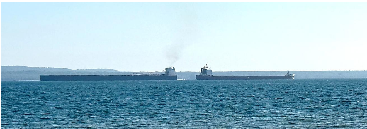
Two thousand-foot ore carriers pass each other on Lake Michigan.

Our leaders told us that each site would improve as we traveled along, and they did not disappoint. They also used a CB radio and would narrate when traveling to group outings. It was interesting to listen to facts about the area or have sites called out while traveling.