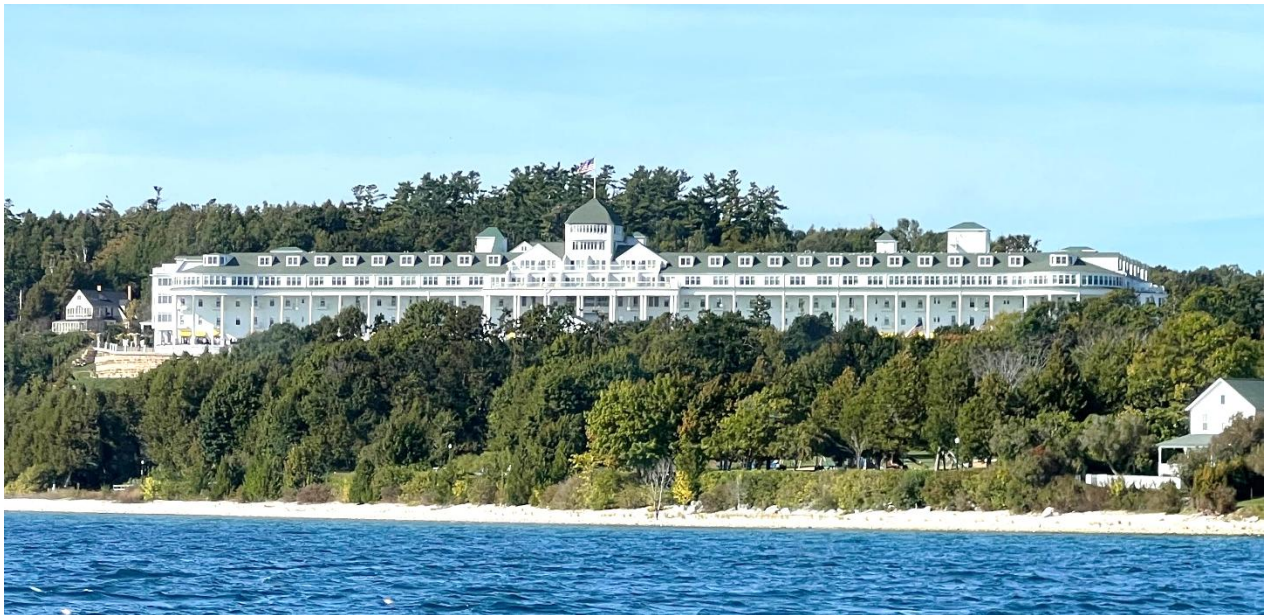
The Grand Hotel Mackinac Island.

appreciated the nonmotorized transportation. I even drove my own horse-drawn carriage. The Grand Hotel certainly lived up to its name. It is Grand. The luncheon was awesome, the hotel's porch is fabulous.