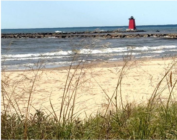
East Breakwater Lighthouse, Manistique, Michigan

The first stop in Manistique was quiet and wooded, with beautiful sites in a state park. We saw a beautiful spring and caught our first glimpse of a great lake, Lake Michigan. The East Breakwater lighthouse was at the end of a jetty. The jetty had waves crashing up onto it like an ocean. The waves were so high that we were unable to walk out to it. It looked like an ocean jetty.