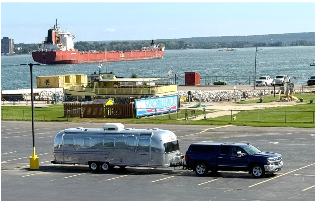
An ore carrier heads south on the St Mary's Rver in Sault Ste Marie.

In a blink it was over, and we were saying our goodbyes to new friends. If you consider a caravan, I would say do it!! I do not think you would regret it.