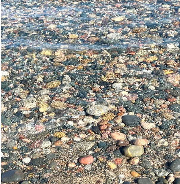
The waters of the Great Lakes are amazingly clear.