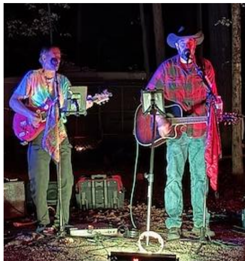
The Cowboy and The Hippy entertained Saturday night.

Kymer's is a large, thickly wooded campground that is roughly half transient and half seasonal. It borders Stokes State Forest on the south and is close to High Point State Park and the Delaware Water Gap