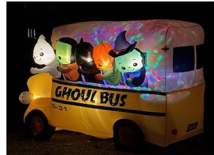
Kymer's was all decked out for Halloween.