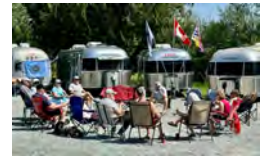
Maintenance Rally, Abbotsford, BC — April 2025

As of June 17, 2025 [Check Newsletters for Updates]