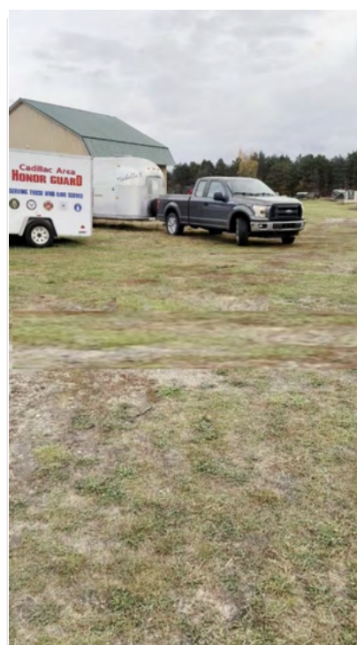
The Shell on its way to a new life