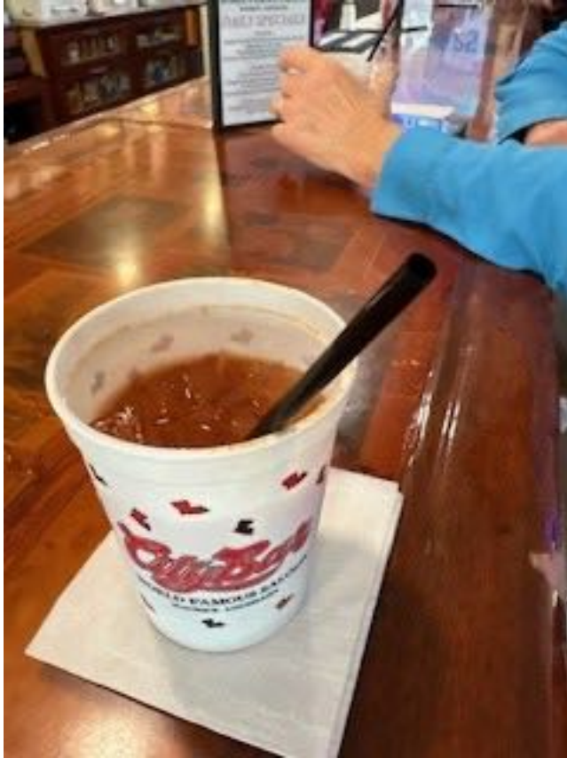
World Famous Bloody Mary served at City Bar, Eunice, LA