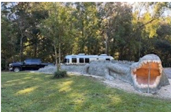
Palmetto Island State Park on the Vermillion River in LA