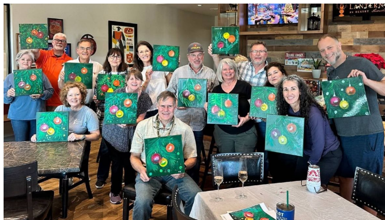
Artistic talents about next year's artwork?