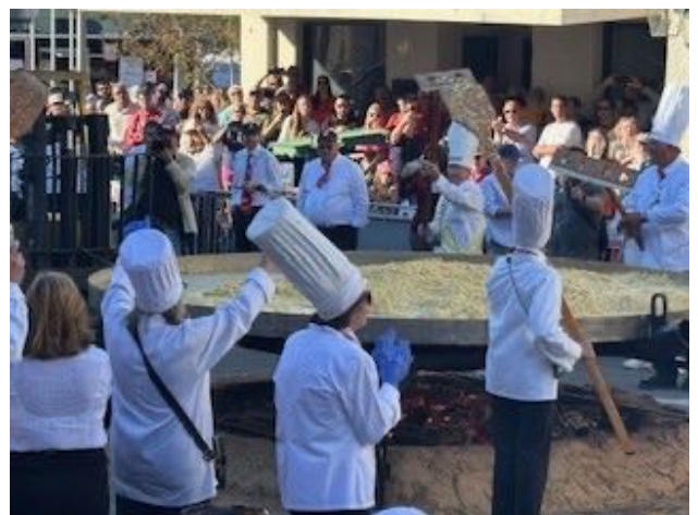
41st Giant Omelet Festival—Abbeville, LA

Cracking 5,000 eggs and baking omelet over open fire!