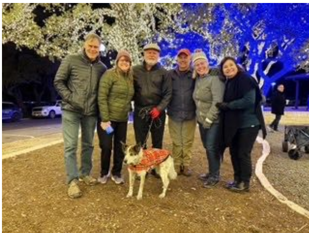
Braving the cold at PEC lights in Johnson City on Sunday night.