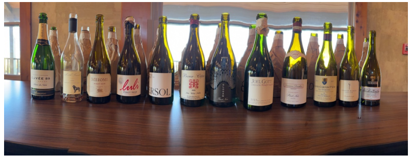
Jackson Rancheria wine tasting