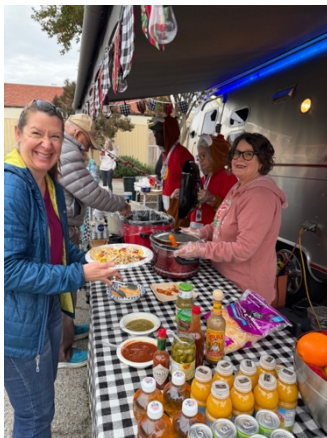
Service with a smile