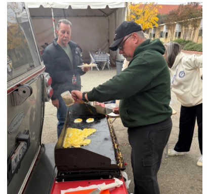
Made to order breakfast