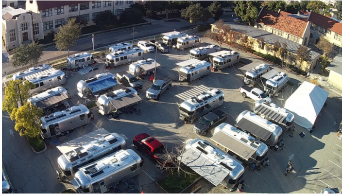
Rose Parade Rally!