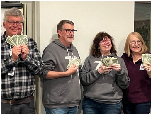
Black Oak winners!