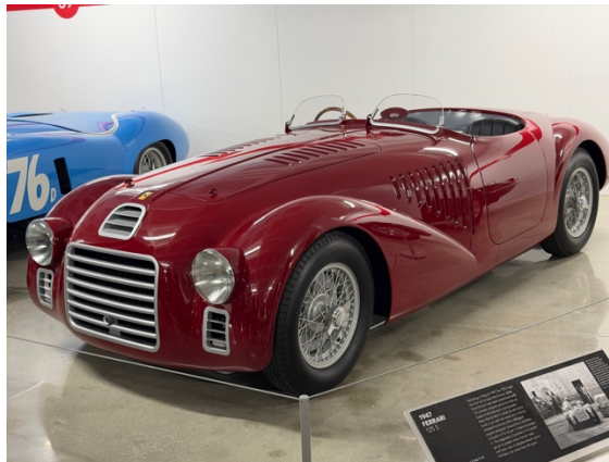
Petersen Automotive Museum