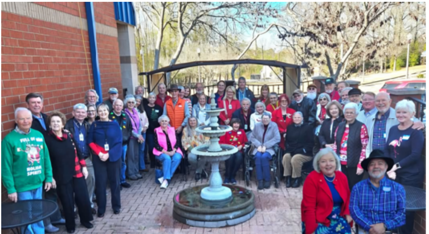
Alabama Airstream Club Christmas Luncheon