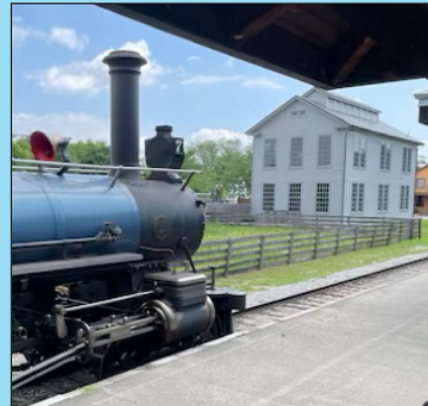
Ride a steam train around Greenfield Village