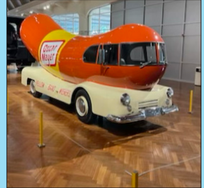
Who can forget the Oscar Mayer Wienermobile?