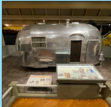
Look familiar? 1949 Airstream Trailwind