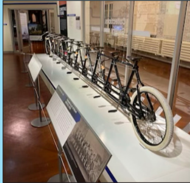
A bicycle built for 10?! —1898 Blue Streak