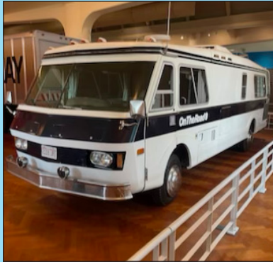
On The Road With Charles Kuralt in a 1975 FMC motorhome