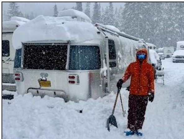
Snow piled around underside to keep heat in

Ski camping in your Airstream is the ultimate ski in and out accommodation!