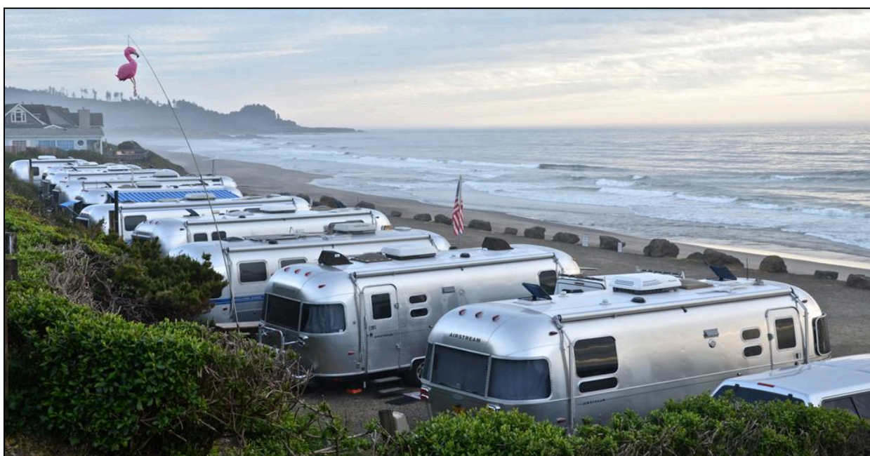
Sea Perch Rally, Yachats, OR

Take a look “behind the scenes” of the OAC Annual Rally Planning Process and see how you can help. With 39 Rallies planned for 2026, you can imagine how planning is key to a successful rally season!