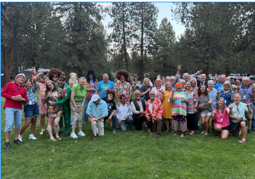
Above: Rally Attendees. Right: More hair and Good vibes!

We're already thinking about the next Joint OR/WA Rally in 2026 – this time in Washington! Until then, keep the good vibes rolling!