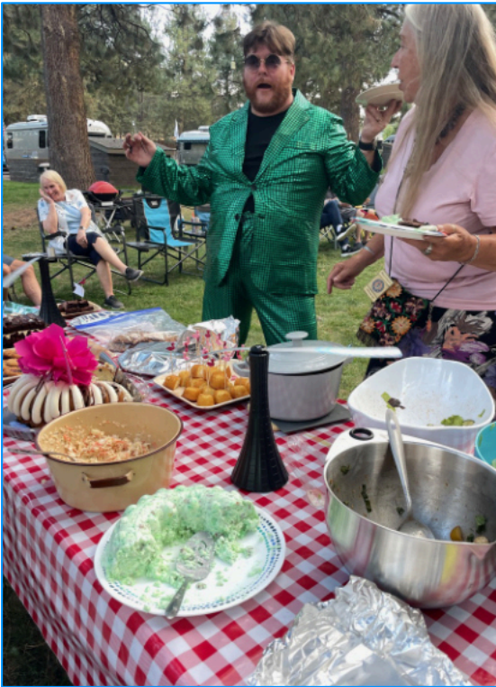
Pot luck - Green Jell-O Salad

When not partying like it was the disco era, attendees explored Bend's endless attractions – biking, hiking, shopping, wineries, farmers' markets, and perfect weather all weekend long.