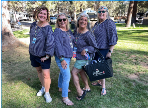
The Rally Hosts