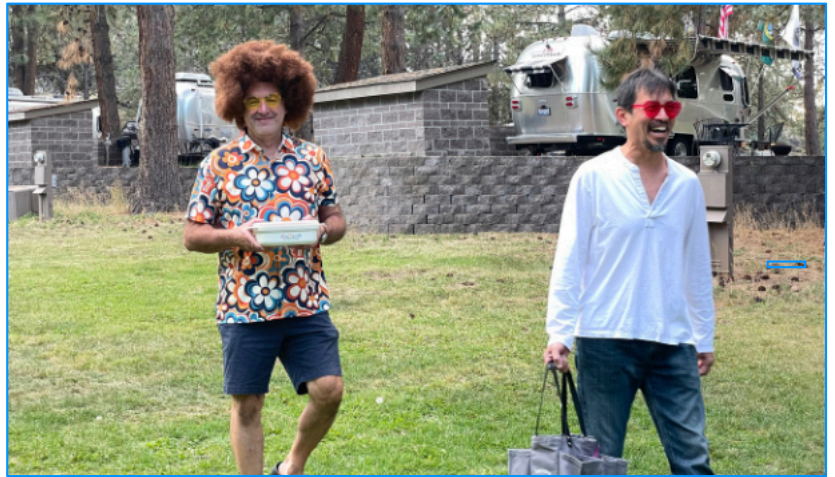
More Miraculous Hair!

When not partying like it was the disco era, attendees explored Bend's endless attractions – biking, hiking, shopping, wineries, farmers' markets, and perfect weather all weekend long.