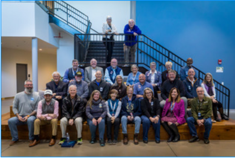
Above: IBT Strategy Meeting November 2025

Wally Byam, the founder of Airstream and our club, believed strongly in bringing people together through shared experiences, friendship, and a sense of belonging. From the earliest caravans, his vision was that everyone—regardless of background or circumstance—would feel welcome around the campfire. Some of the ideas shared at the international level included: