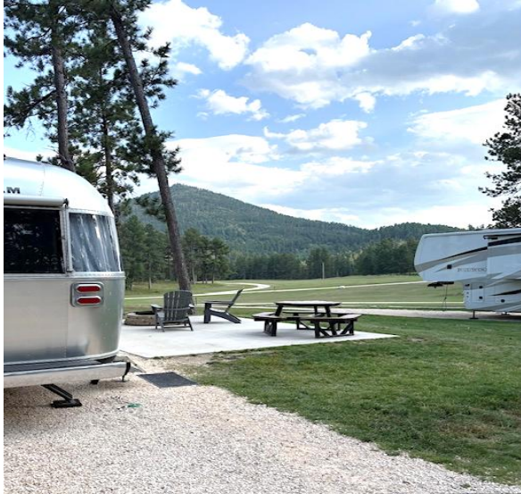
Rafter J Bar Campground, Hill City, South Dakota

Our next destination was Hill City, South Dakota and the Rafter J Bar Campground. To get there, we drove back down Route 90 past another 100 signs for Wall Drug Store and then down Route 16 to the campsite. Nevertheless, we had to visit Wall Drug Store after all the signs. Besides the Drug Store, there are about four blocks of other stores (restaurants, jewelry stores etc.). It was worth a brief stop – good chocolate donuts.