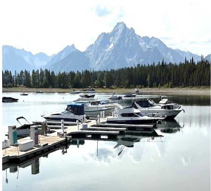
Coulter Bay Marina

The Grand Canyon of Yellowstone is breathtaking. It has dramatic cliffs, waterfalls, and vibrant colors. There are many different vantage points to take great pictures. They say you can never see all of Yellowstone. With a week, you can touch the surface. We had three days.