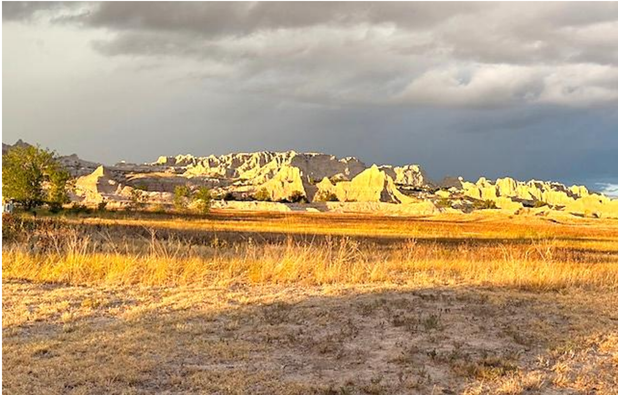
Cedar Park Campground, Badlands National Park just before the storm.

horizontal striations (bands) representing millions of years of deposited sediment, soil, and volcanic ash. The campsite brochure states that the natural beauty of this landscape makes for stunning sunrises and sunsets. It did not disappoint.