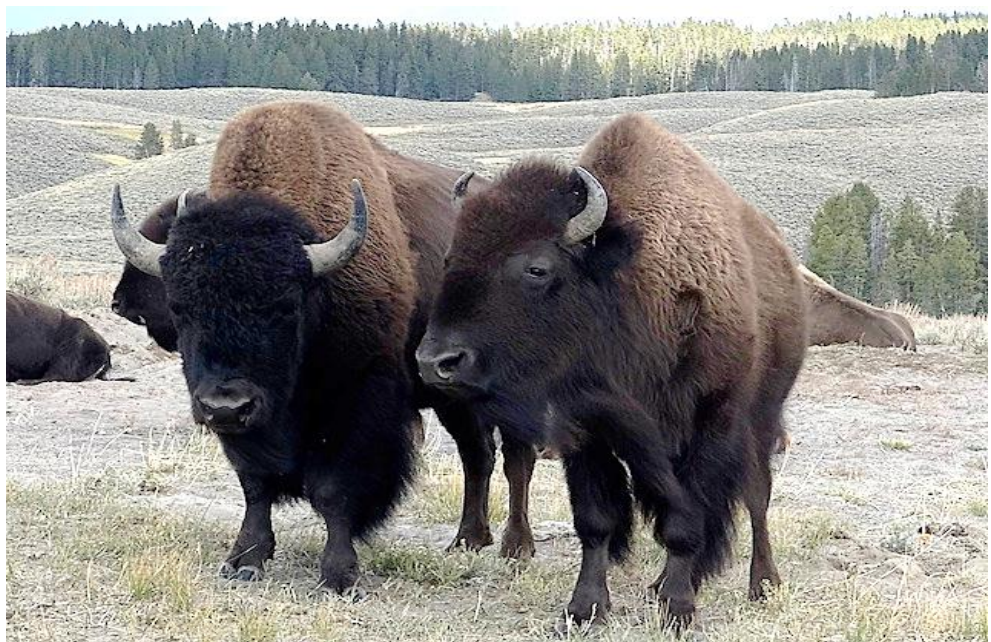
Bison by the side of the road, Yellowstone.

there was over an hour's wait at the entrance the week before we went there. Pro tip – buy the America the Beautiful Pass (we purchased the Senior (over 62) Lifetime pass for $80 which lets you into all of the national parks). In Yellowstone, there are different lines for those with the passes or who have prepaid entrance pass and those purchasing entrance fees. We were fortunate. The line was not that long. Once in the park, we drove down the loop to the Old Faithful Lodge to view Old Faithful. There is a sign there that tells you when the next eruption will be within about a 20-minute window. The Old Faithful Lodge is historic and has a balcony on the second floor with benches to view Old Faithful. It was a good location to grab lunch and wait. Old Faithful was on time and impressive. The next stop was Grand Prismatic Spring. It is set up nicely. You park in a lot and there are bridges and walkways to get close to the hot springs. However,