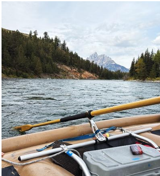
Rafting down the Snake River.

After our stay in West Yellowstone, we traveled through Yellowstone National Park over the Continental Divide to Grand Teton National Park and its Colter Bay RV Park (note Colter Bay RV Park has full hookups, Colter Bay Campground (in the same complex) has no hookups). Colter Bay is located on