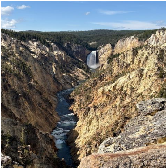
Grand Canyon of the Yellowstone.

We camped at Yellowstone Grizzly RV Park in West Yellowstone, Montana. It was three blocks from the West Entrance and in town so easily walkable to any location. The town has many restaurants, bars and shops. The campsite has large pull through full hookup campsites and we camped next to an Airstream club member from Delaware.