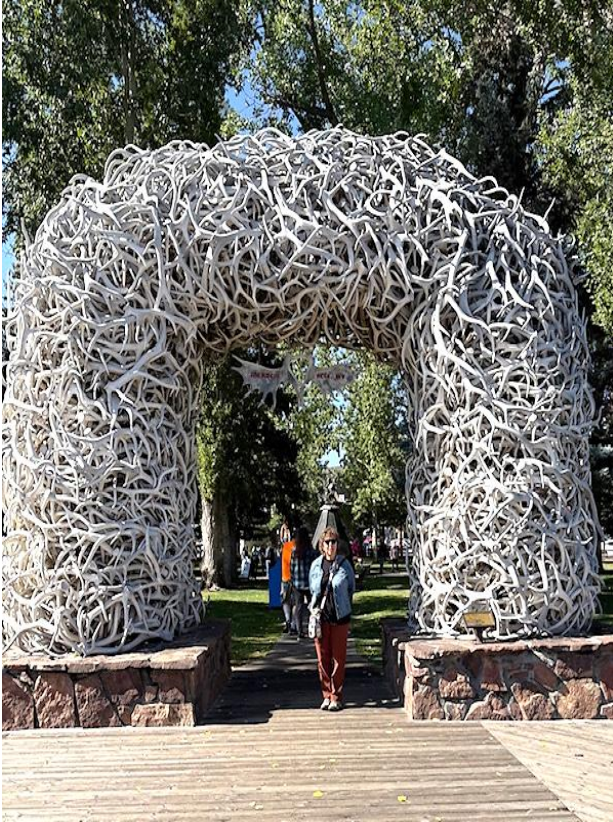
Antler archway Jackson, Wyoming.

you see the area from a different perspective. Our guide explained the history of the area, the names of the various mountain ranges and stories from the past. We saw many eagles and other wildlife, and the views in Grand Teton Park are spectacular.