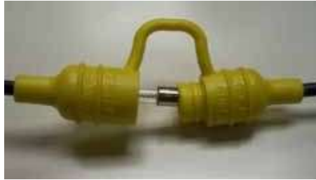
130 Amp Fuse for Power Jack