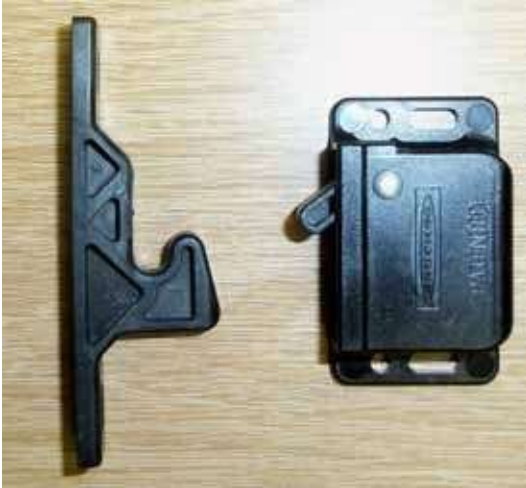
Grabber Catch Complete Assembly catch hook