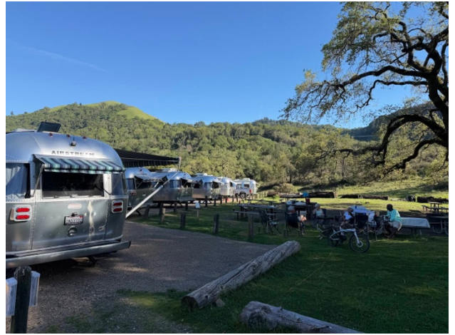
Sugarloaf Ridge – Robert Ferguson Observatory