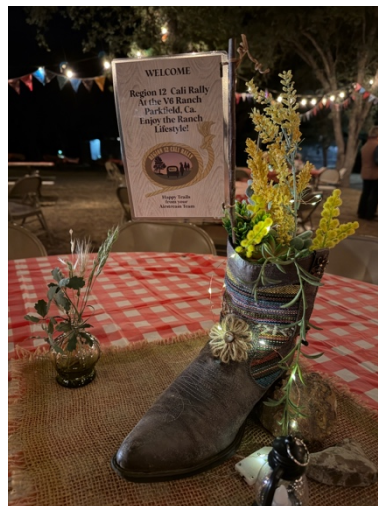
Parkfield 4H Fundraiser