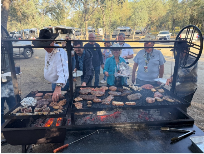
BYOP – Bring your own protein Cali Rally