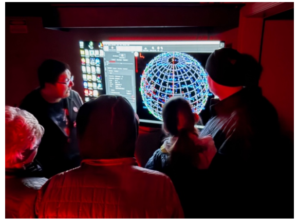
Star learning – Robert Ferguson Observatory