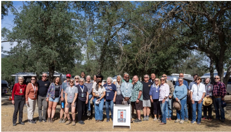
GBAAC well represented at Cali Rally