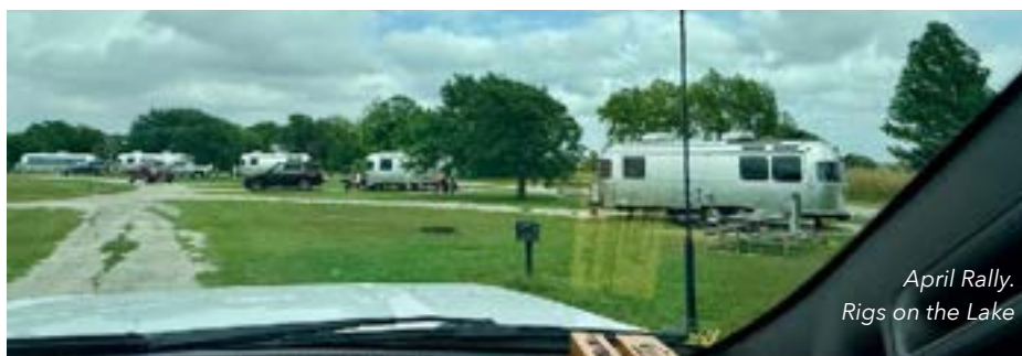
April Rally. Rigs on the Lake

Your input will be posted on the GHAC website for all to enjoy and benefit from!