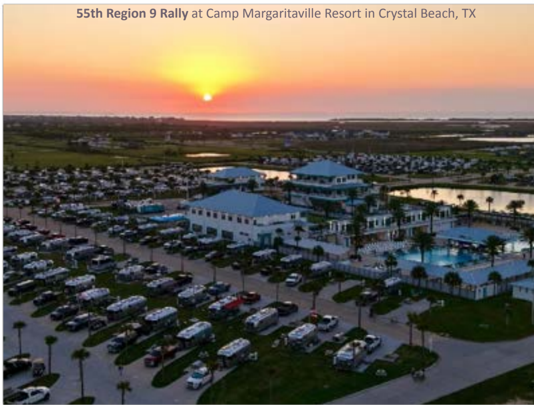
55th Region 9 Rally at Camp Margaritaville Resort in Crystal Beach, TX