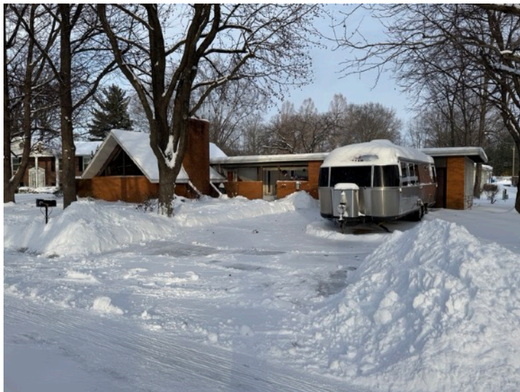
GSLAC Newsletter Headquarters