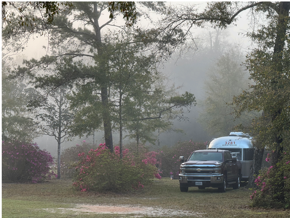
This month's newsletter brought to you from Mystic Springs Airstream Park, McDavid, FL.