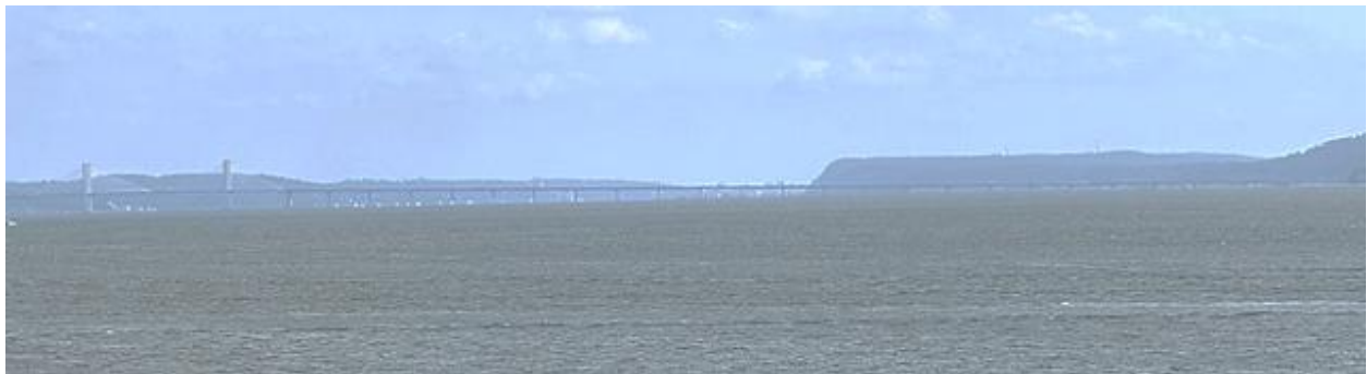
The view south from the park takes in the Tappan Zee, the new bridge that everyone calls by the old bridge's name, and the volcanic cliffs of the New Jersey Palisades.

Discounted music festival tickets are on sale now