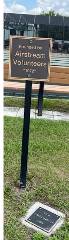
Traveler's Rest marker and time capsule.

Emails went out recently regarding the rally, with a link (and a revised link) to the event page and its link to the jotform. If you are registered for the Unbutton, please use the link to pay the $20 per person rally fee, or mail a check to me at 253 Lily Road, Egg Harbor Township, NJ 08234. More info will follow.