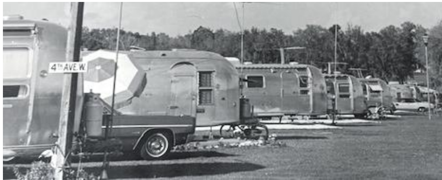
Airstreams parked at Traveler's Rest around the time it opened in 1972. Note the whitewall tires.