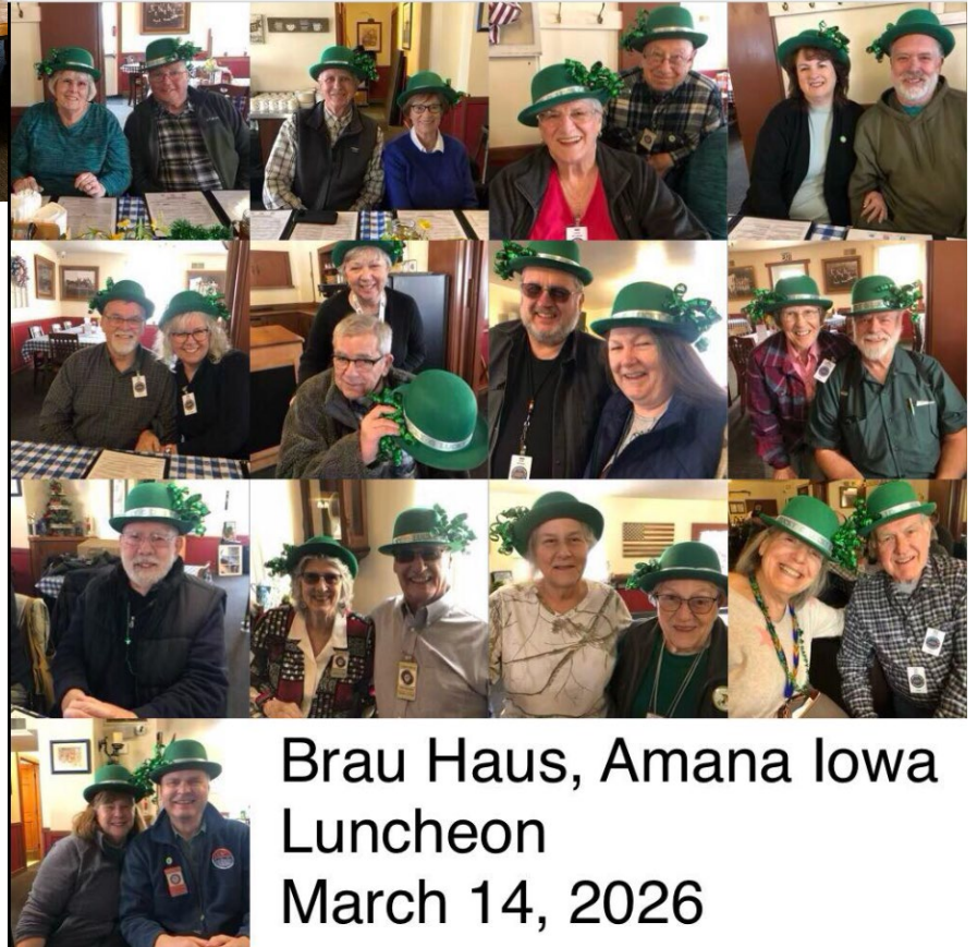
Brau Haus, Amana Iowa Luncheon March 14, 2026