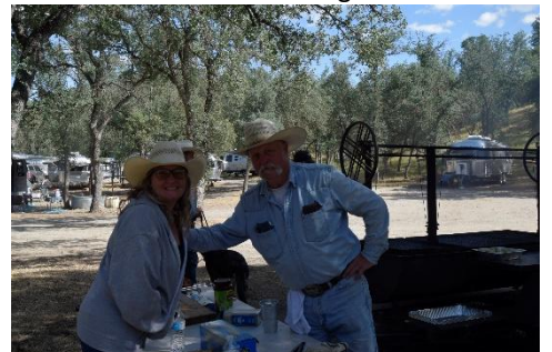
The Grill Masters