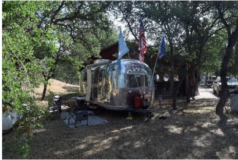
Peoples Campsite Near the Clubhouse