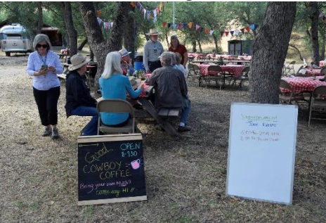
Cowboy Coffee Sign