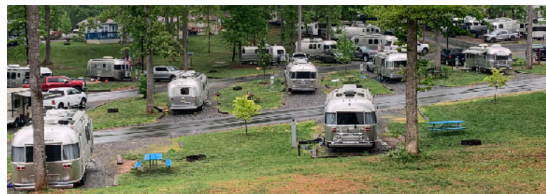
A rainy Saturday did not dampen our learning and socializing.