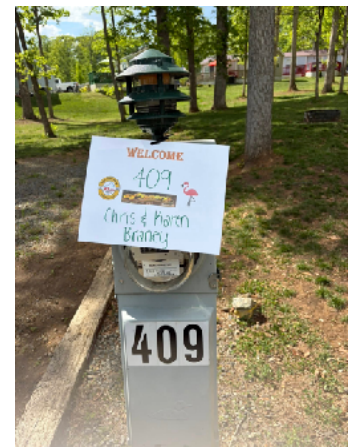
Evidence of Tom's attention to details.