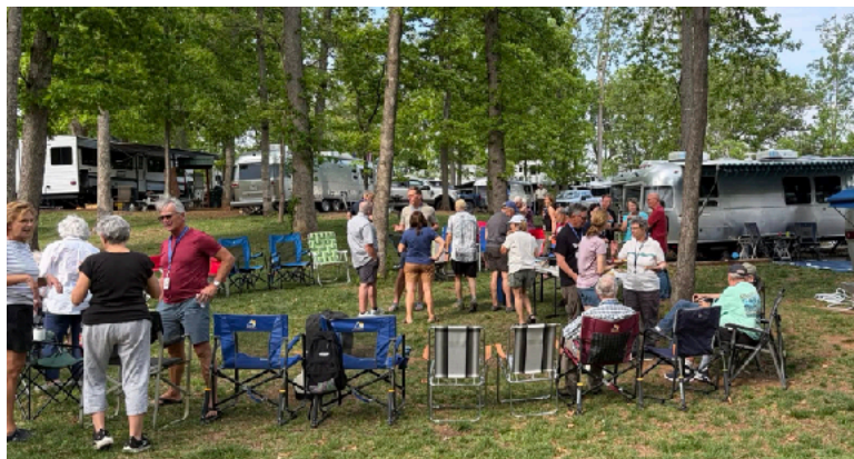
Happy hour before introductions.