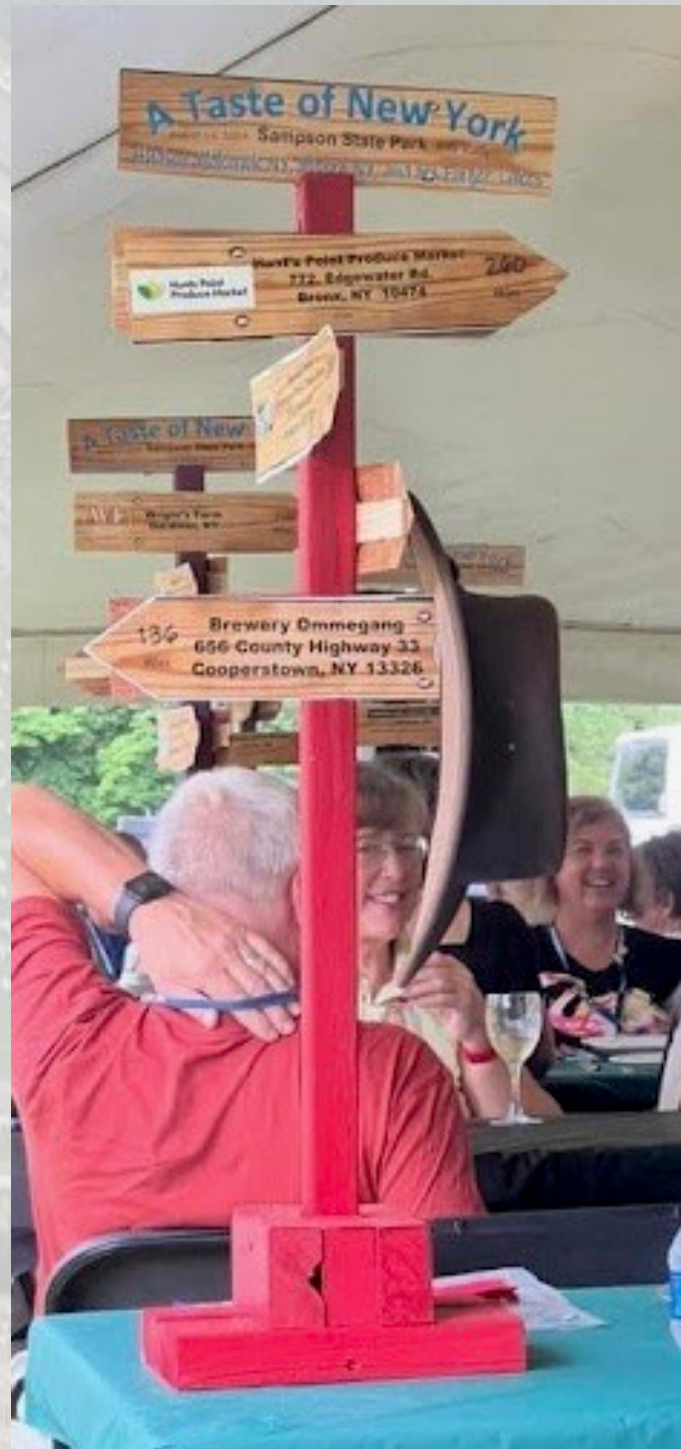
Above - One of the famous centerpieces