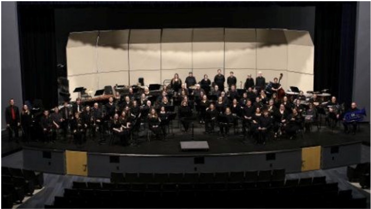
Minot Community Band On Stage

Magin in Minot! The Airstream Club Concert Band is preparing to play alongside the (Facebook link below)