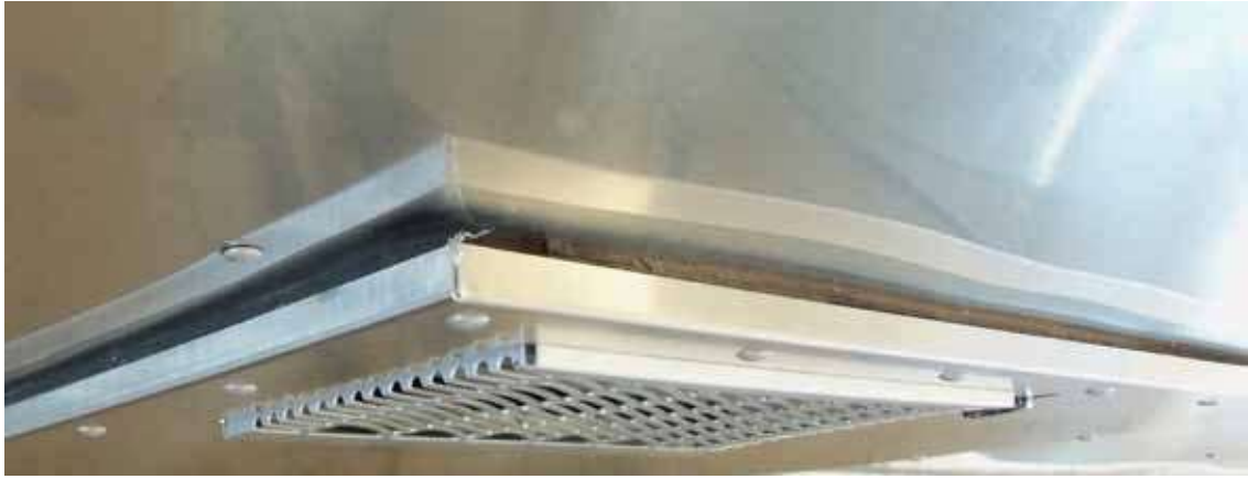
3/16" flange on edge of door to cover appliance frame