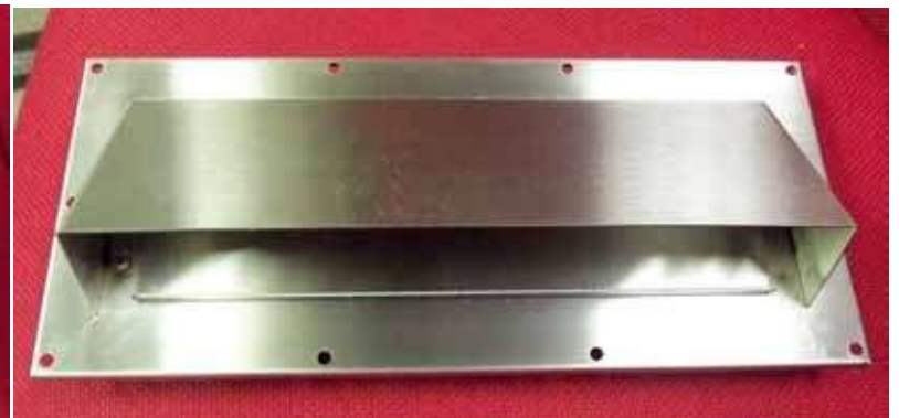
Alternative Stainless Steel Range vent PN: 39763W