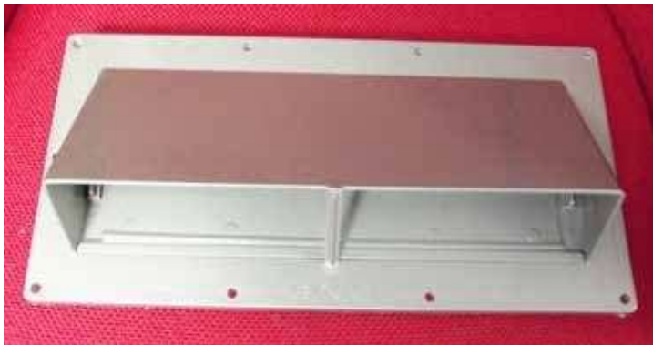
Current Plastic vent