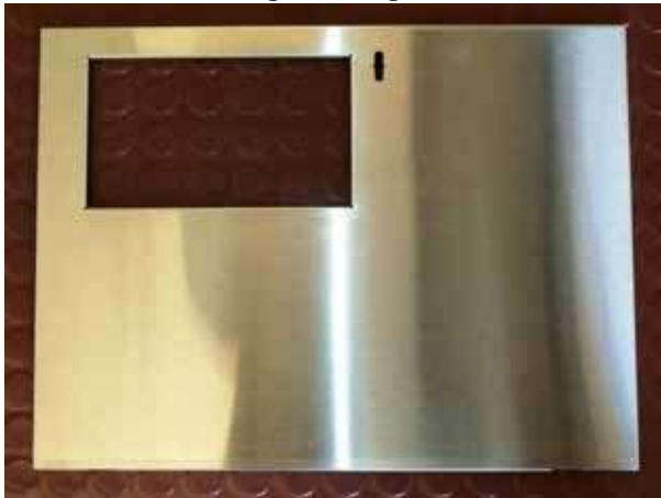
Water heater door-PN: 39765W-02