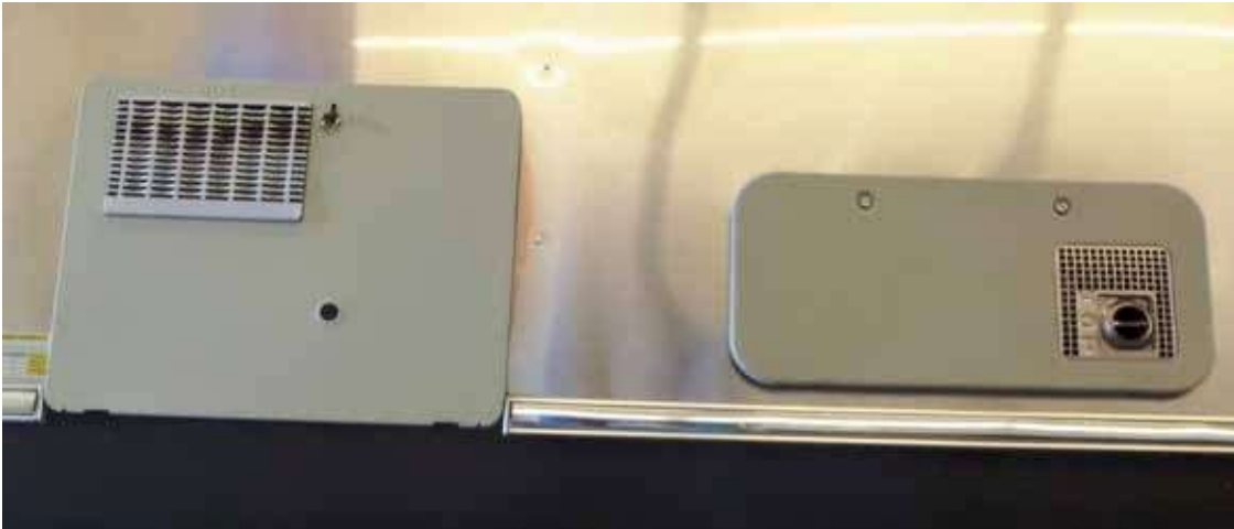
Current Atwood Water Heater and Furnace Doors

We also have developed a Stainless steel Range exhaust vent in lieu of the current plastic version.