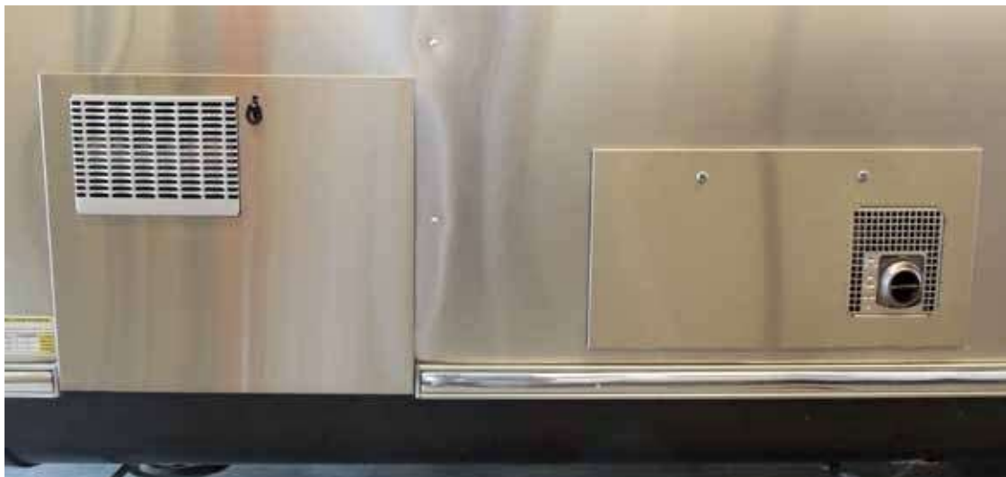
Stainless Steel Alternative Water Heater and Furnace Doors Water heater door -PN: 39765W-02 Furnace Door -PN: 39764W-02

If you have any questions about any of these items call 937 596 6111 ext. 7400 or 7416.